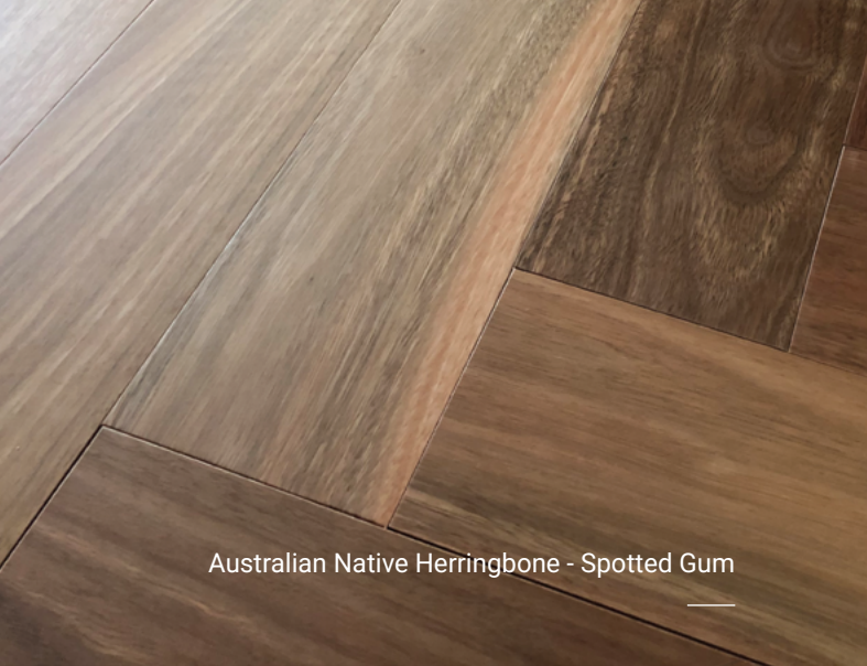
Australian Native Herringbone - Spotted Gum